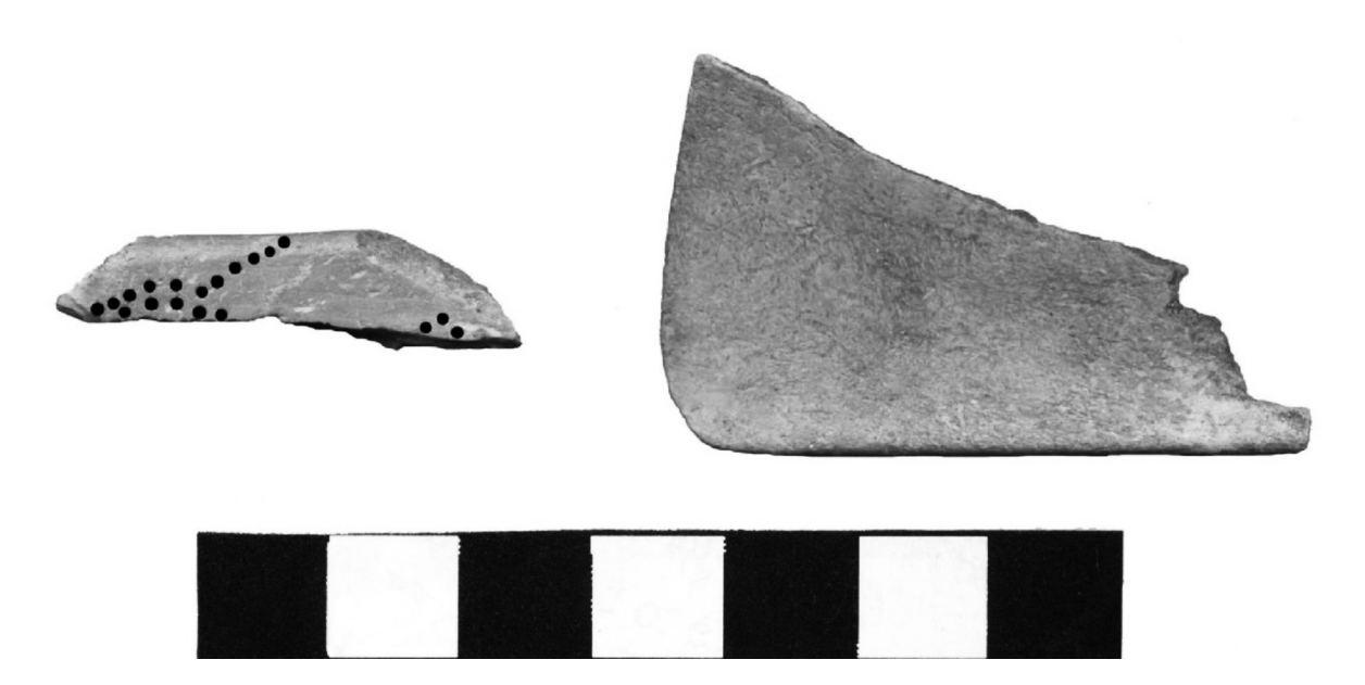
Fig. 4. Bone artifacts from CA-SMI-657 with circular depressions highlighted on specimen at left. Scale shows centimeters.

The second bone artifact may be a fragment of a split dolphin or porpoise jaw hairpin. The proximal end of this possible hairpin has been shaped and smoothed and is similar to hairpins from burial assemblages analyzed by King (1990:29-31) from Cemetery A at Tecolote Point (CA-SRI-3) on Santa Rosa Island. King (1990:258) attributed these tools to his phase Ex (ca. 7500-6400 cal BP), somewhat earlier than the <sup>14</sup>C dates from the northern locus at CA-SMI-657. Although Orr (1968) concluded that all 79 burials (and associated grave goods) from Cemetery A dated to the Early Holocene, Erlandson (1994:189) concluded that the cemetery included several burials associated with a roughly 4000year-old midden overlying the cemetery-raising questions about the antiquity of some of the bone tools. Our data demonstrate that these relatively elaborate bone tools were made and used at least 6000 years ago on San Miguel Island, increasing the likelihood that they may also extend back even further in time as King (1990) suggested.