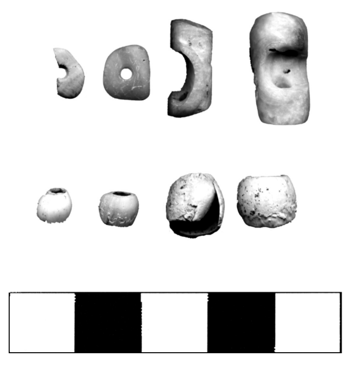
PCAS Quarterly, 40 (1)

Fig. 3. Shell artifacts from CA-SMI-657 (top row: two Olivella wall beads at left and two Hinnites tube beads at right) and CA-SMI-557 (bottom row, four Olivella barrel beads). Scale shows centimeters.