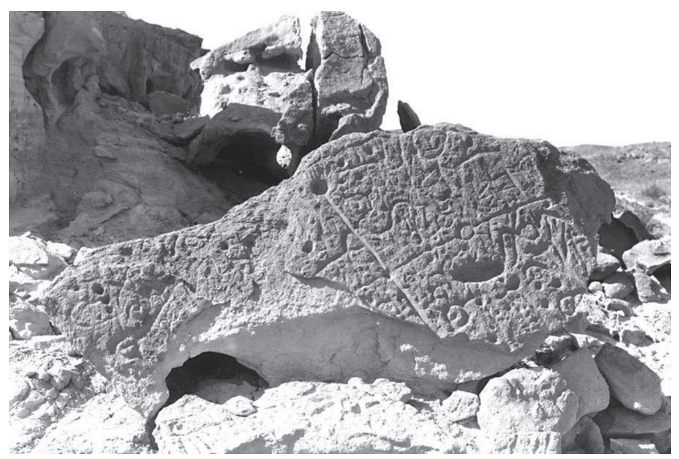
Figure 1: CA-IMP-268/6905, Locus 2, Panel 63.