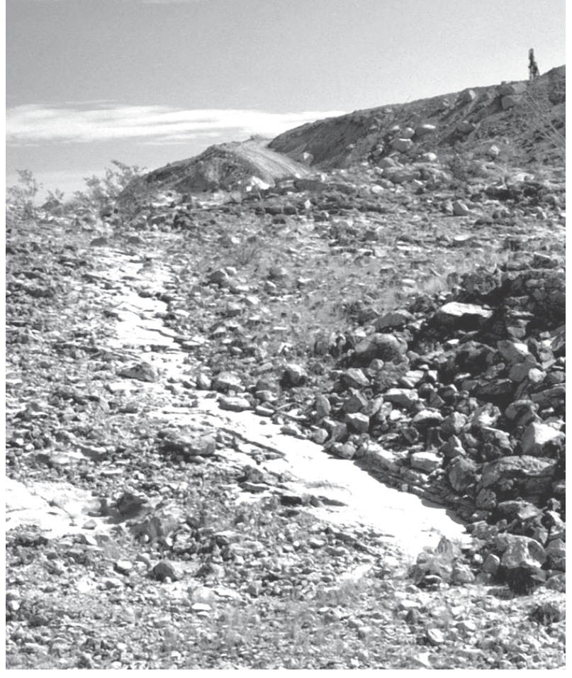
Figure 6: CA-IMP-268/6905, Trail, Locus 7, Panels 1-4.