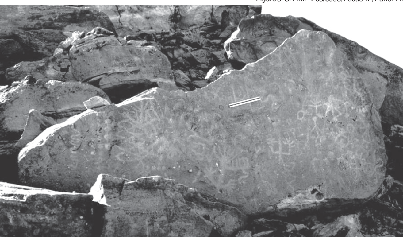
Figure 8: CA-IMP-268/6905, Locus 12, Panel 11.