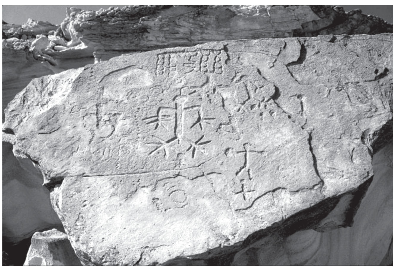
Figure 7: CA-IMP-268/6905, Locus 11, Panel 1.