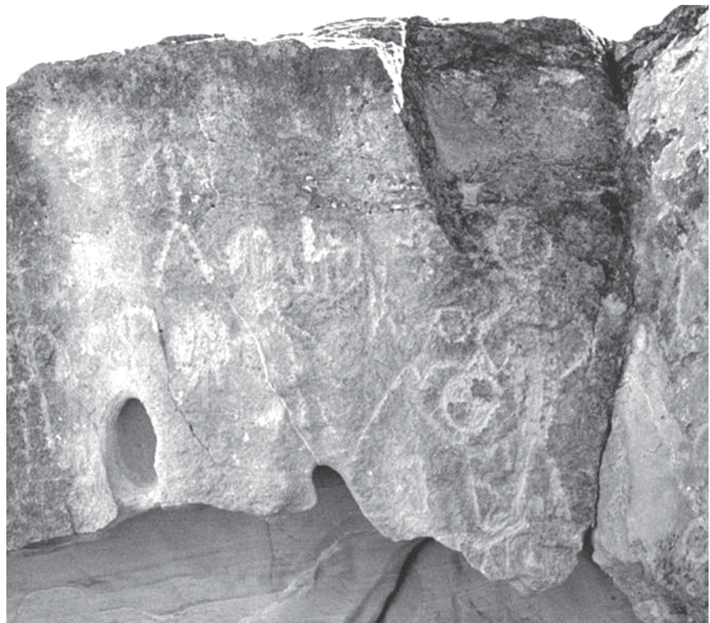
Figure 2: CA-IMP-268/6905, Locus 2, Panel 46.