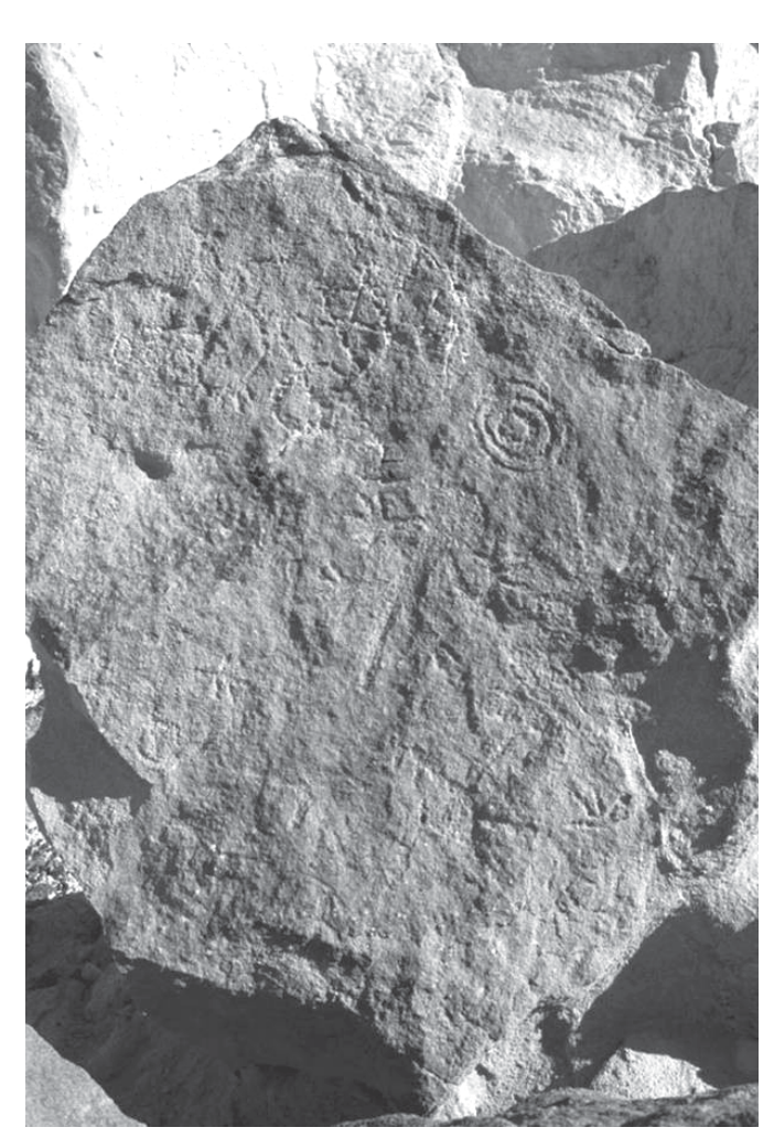
Figure 3: CA-IMP-268/6905, Locus 3, Panel 1.