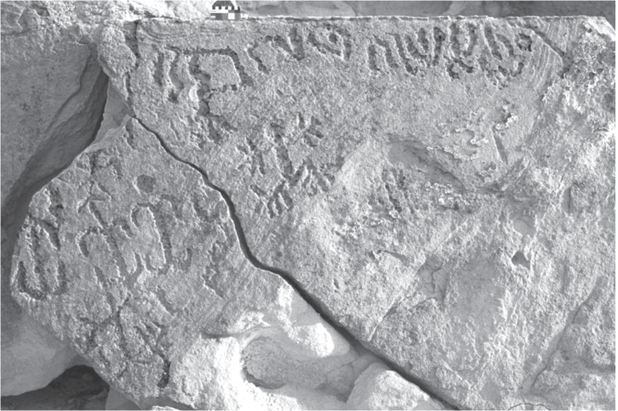
Figure 4: CA-IMP-268/6905, Locus 5, Panel 1.