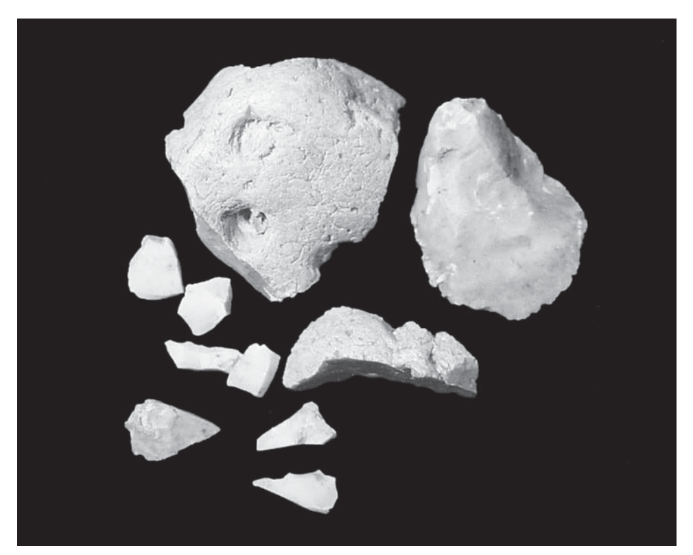
Figure 3: Typical refit cluster of chert flakes and core.

Clusters of identical lithic material (refit clusters) consisting of discreet concentrations of cryptocrystalline silicates (CCS), quartz, quartzite, or metavolcanics were recorded in virtually every surface and subsurface assemblage (Figure 3). A of 92 total such concentrations were noted during the attribute analysis which preceded the refitting study. These clusters included 43 of CCS, 14 of quartzite, and 35 of various metavolcanics. In general, the numbers of these concentrations conform roughly to the frequency of these raw materials represented in the debitage of each site. Simply, if, for example, a