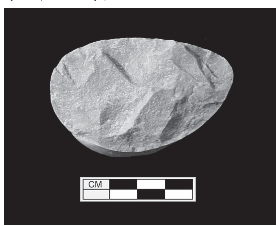
Figure 1: Topaz Mountain single platform core

The attribute-based portion of this analysis was based on a methodology that, while employing basic variables present in both typological and technological analyses, incorporated numerous factors derived solely from previously conducted experimental studies.