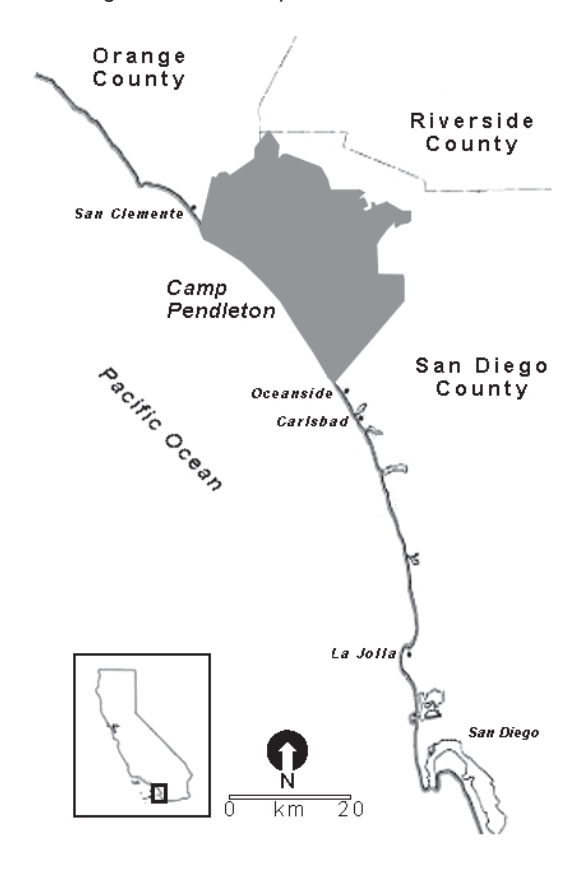
Figure 1: MCB Camp Pendleton Location.