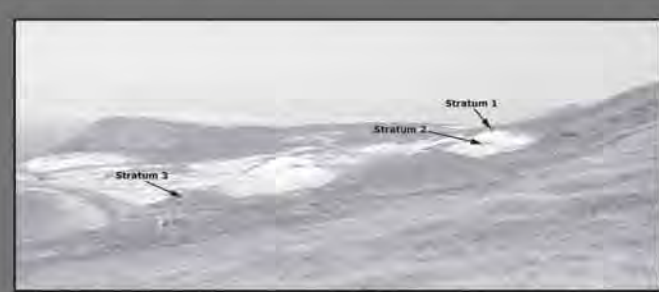
View of entire site looking northeast.

The Channel Islands have a lengthy archaeological record, spanning roughly 13,000 calender years. Relatively little is known about cultural developments during the Middle Holocene, however, leaving a substantial gap in our understanding of regional prehistory (see Glassow 1997; Kennett 2005). Our research at CA-SRI-667, a large dune site with three components dated between about 6200 and 4000 cal BP, demonstrates significant changes in the composition of local environments and shellfish communities. Faunal remains and artifacts from the site document the disappearance of a local estuary, intensive dune-building episodes, and the presence of relatively mobile settlement systems.