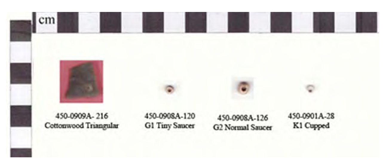
Figure 2. Cottonwood projectile point and most common Olivella beads.