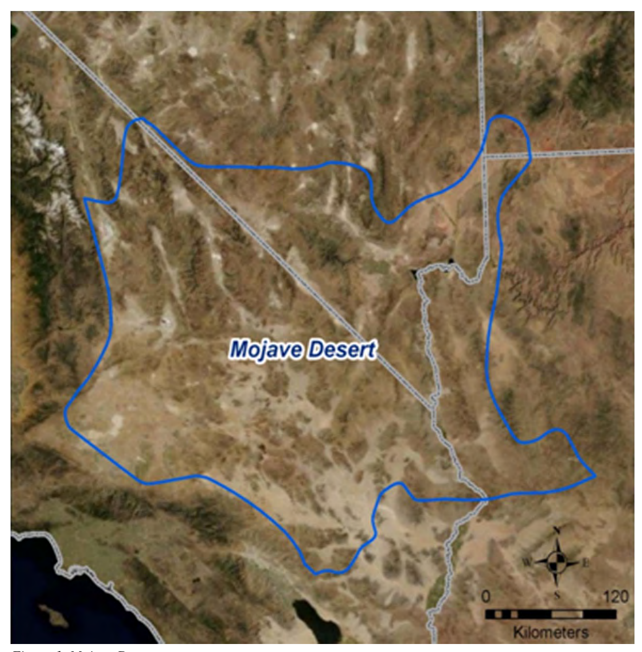
Figure 1. Mojave Desert.

questions about the prehistoric behaviors associated with stone-tool procurement. If quality lithic materials are concentrated in these areas, should reduction patterns be the same in other areas rich with toolstone, or should reduction patterns differ from area to area? Should such site areas be conceptualized as "stone-rich" environments, or merely as places where people stopped briefly on their way to somewhere else? Several terms and concepts are frequently associated with such contexts; these are discussed below and help us to clarify these questions.