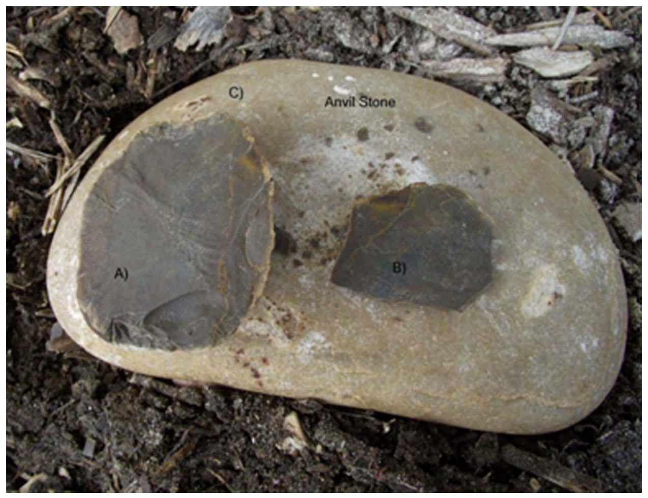
Figure 4. Bipolar reduction: A) bipolar core; B) bipolar flake; C) the proximal end of the core with crushing.