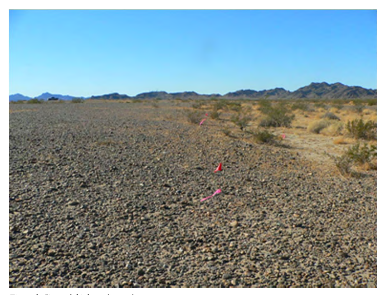
Figure 2. Site with high-quality toolstone.

areas where raw materials have been assayed (Wilke and Schroth 1989) and cobbles have been tested or quarried. The assaying and testing of lithic materials are two different ways of saying the same thing. Further, some have described the behaviors at these sites as quarrying (Wilke and Schroth 1989), while others disagree, contending that quarries are more appropriately defined as pits or shafts that have been dug to extract specific resources. At cobble terrace and desert pavement sites, the materials are surface deposits, which do not require pits or shafts to recover the materials.