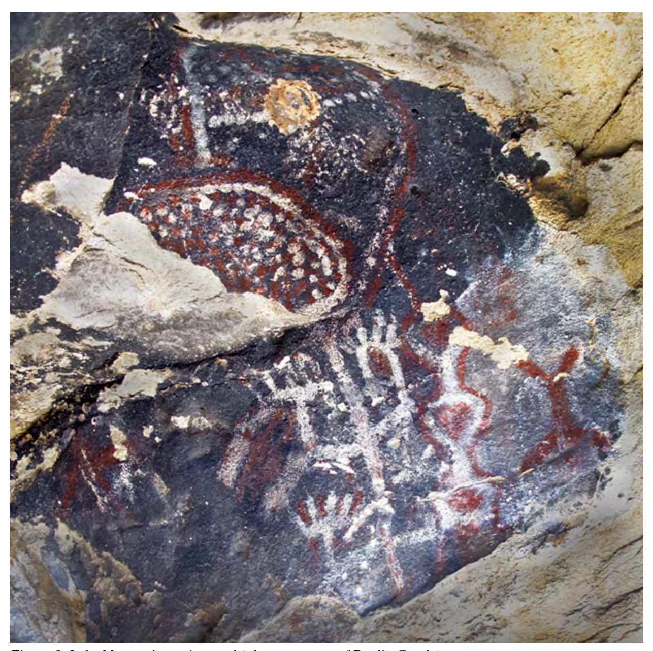
Figure 3. Lake Manor site main panel.

arrowheads on the surface of the ground [i.e., VEN-148]. . . . Menendrez volunteered . . . that one long rancheria extended from where we were a couple of miles to the southwest and that fragments of shell, etc. . . . are picked up [along] this whole stretch [Harrington 1917 Reel 106-152:1:7; Johnson 2006:40].