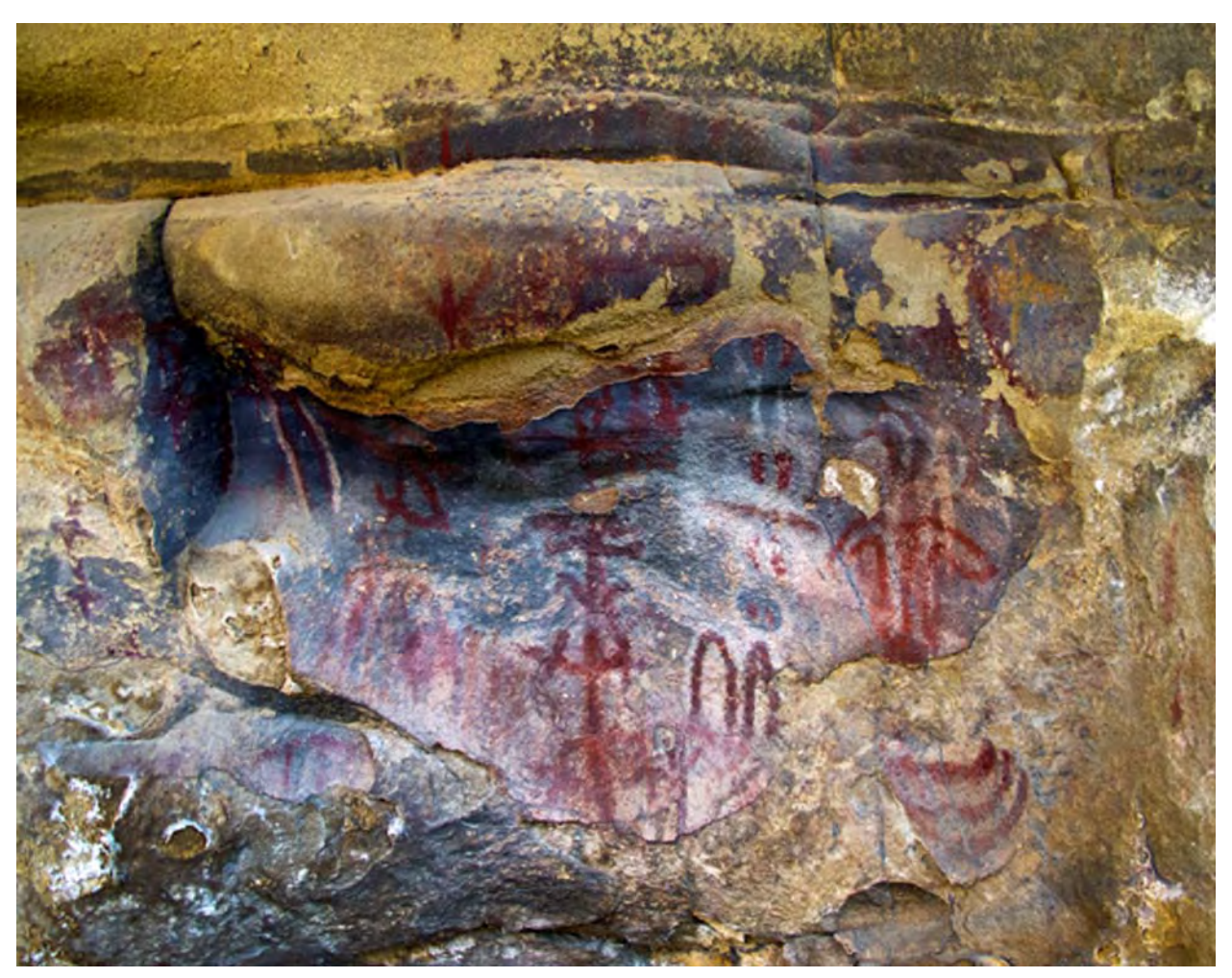
Figure 4. Chatsworth site main panel.

projectile points made from rhyolite, fused shale, chert, chalcedony and obsidian, flakes, 843kg. of burnt rock . . . and some 8000 faunal specimens [Nupuf 2010:1].