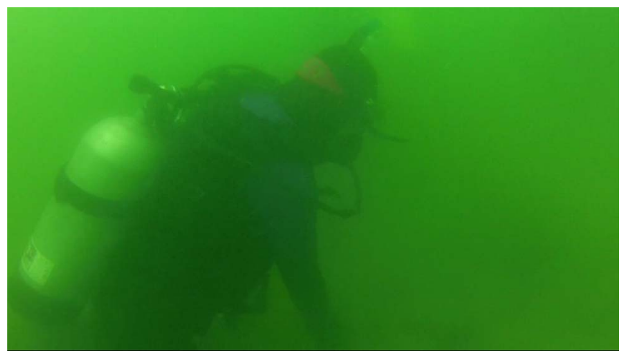
Figure 5. Poor visibility underwater.