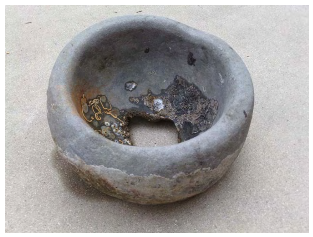
Figure 2. Stone bowl discovered off the coast.