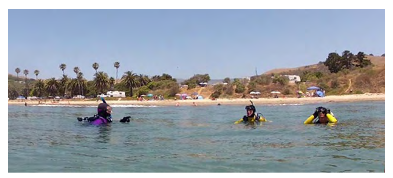
Figure 3. Divers conducting the survey.