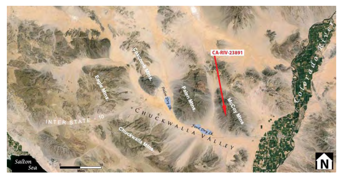
Figure 2. Map aerial image, from Google Earth 2014.

The point has no apparent edge grinding. Rondeau concluded that while this specimen is clearly a reworked fluted point, its reflaked and fragmentary condition make its placement as a Clovis-like specimen or possibly as a post-Clovis fluted point unclear. In spite of such uncertainties, it adds additional data to the information base of the CalFLUTED project and the study of fluted points in the Far West.